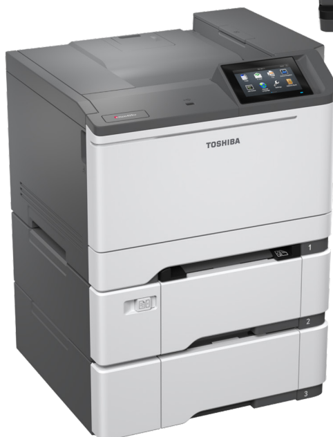
e-STUDIO409cp with 3 Cassettes