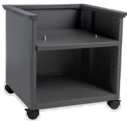
Adjustable Printer Stand